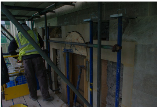
March 2012: stonemasons at work to reinstate the Venetian window in the south wall of the future Introduction Room.

One of the most exciting recent developments is the reinstatement of the Venetian windows into the south and east walls of the south ground floor room, which will be the future Introduction Room. This will help to restore some of the original character of 1a, and make it more in keeping with the surrounding buildings. Some of the stonemasons' work is being captured on camera as part of our filming project, which will record key changes and works to both No. 1 and 1a.